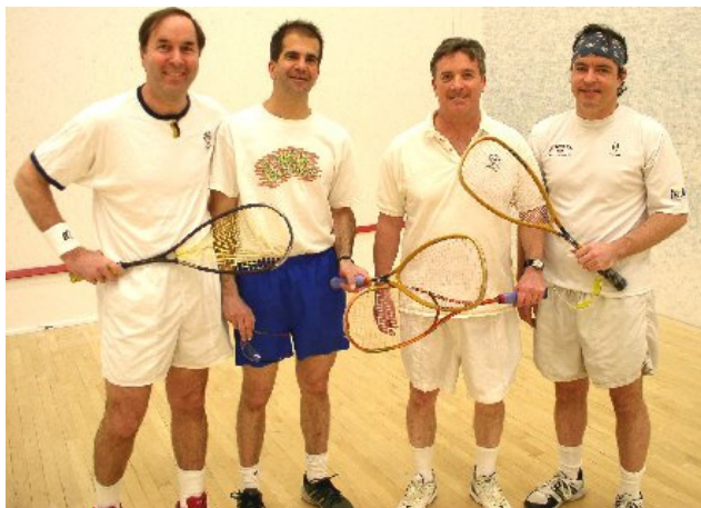
2006 MSRA "A" Doubles: