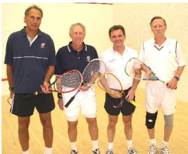
2006 MSRA 60+ Doubles: