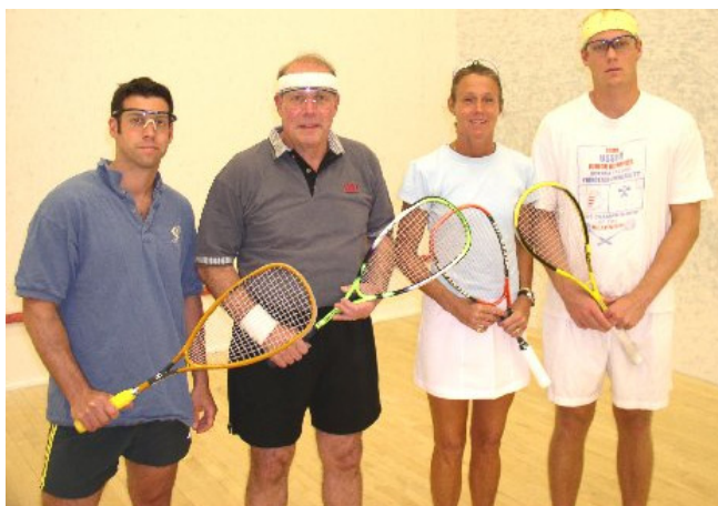
2006 MSRA Parent/Child Doubles: